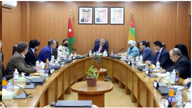
Nebraska delegation visits the University of Jordan.