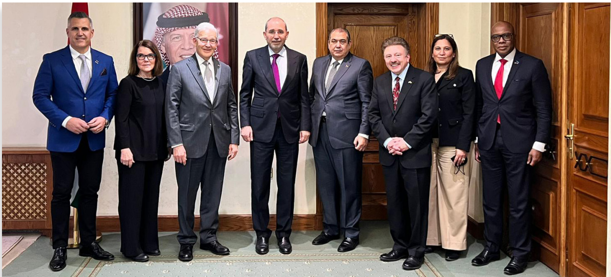
H.E. Dr. Ayman Hussein Al-Safadi (center), Deputy Prime Minister and Foreign Minister of Jordan, receives Nebraska delegates.