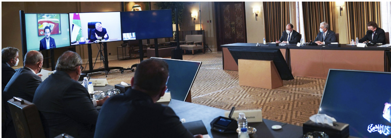
H.M. King Abdullah II of Jordan received the Nebraska delegates at the Husseinayah Palace. He was joined by HRH Al Hussein bin Abdullah II, Crown Prince of Jordan, the U.S. Ambassador, and members of the King’s cabinet.

In Jordan, the delegation was especially honored to meet with H.M. King Abdullah II, who received the Nebraska delegates at the Husseinayah Palace.