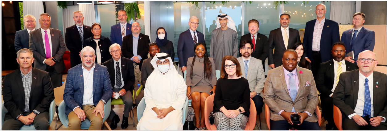
H.E. Dr. Thani bin Ahmed Al Zeyoudi (center rear), UAE Minister of State for Foreign Trade, discusses business development opportunities with Nebraska delegates.