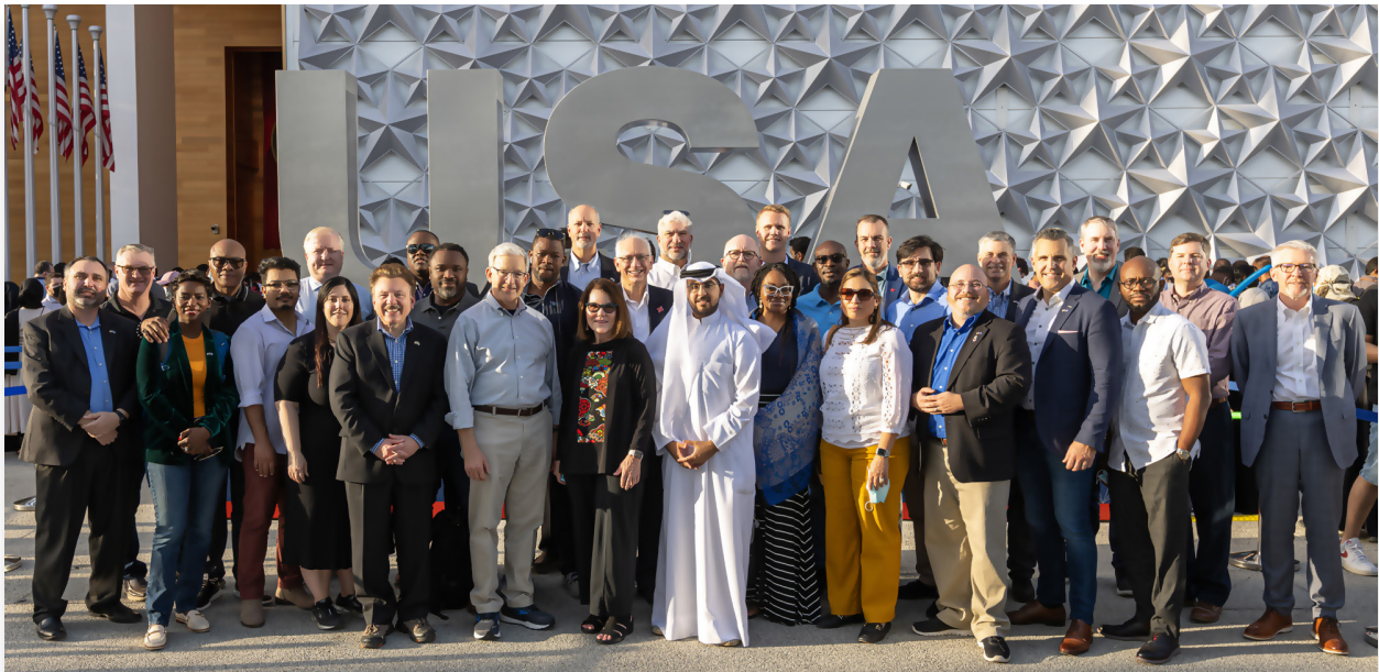
The Nebraska delegation visits Expo 2020 in Dubai.

Expo 2020 and Gulfood Showcase the State of Nebraska