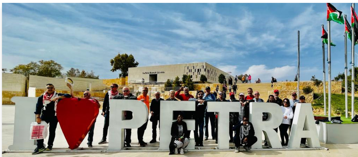
During the Nebraska delegation’s last day in Jordan, they visited historic Petra.