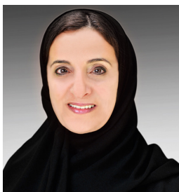
H.E. Sheikha Lubna Al-Qassimi