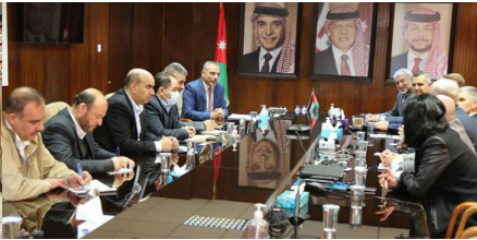
Nebraska delegation at Jordan's Ministry of Water and Irrigation.