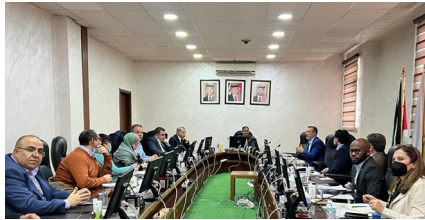
Nebraska delegation at Jordan's Ministry of Higher Education.