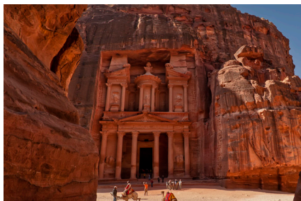
The Treasury, Petra