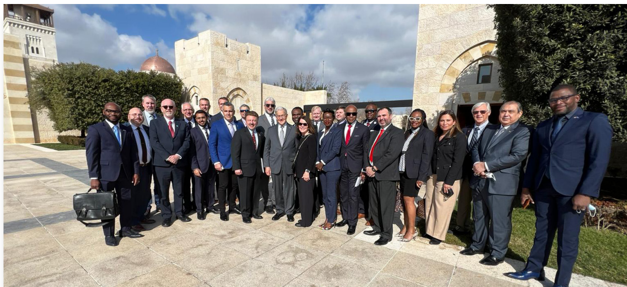
Nebraska delegates visit Al Husseiniya Palace.