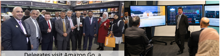
Delegates visit Amazon Go, a cashier-less grocery store in Seattle.