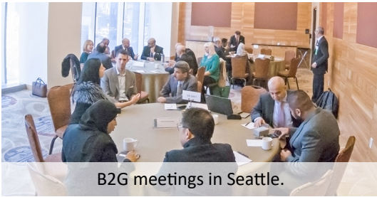
B2G meetings in Seattle.