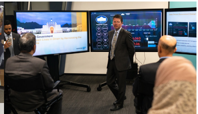
SAP site visit.