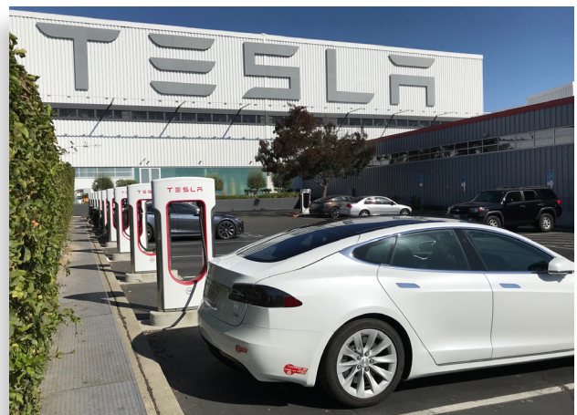
Omani delegates met with Tesla leaders in Fremont, California (shown here), where Tesla operates an all-electric automobile manufacturing plant.

According to the Oman Country Commercial Guide , produced by the U.S. Embassy in Muscat, a “sizeable market exists in the transportation and logistics sectors in Oman with the government focus on economic diversification . . . . Strategic objectives over the past few years have been focused on easing congestion and enhancing capacity by investing in infrastructure and technology for the upgrade of ports, airport facilities, and new road links.”