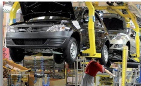
Renault factory, Tangier