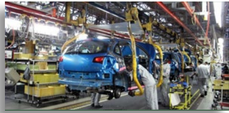
Tangier Automotive City

In the words of U.S. Ambassador Dwight Bush, "Morocco is thinking 'outside the box,' building a strong infrastructure and service sector so that it can serve as an export platform for the continent." The country's "banking, education, logistics, and manufacturing footprint can bridge distant markets," Bush suggested, and the "skills and technology transfer that accompanies this type of engagement has the added benefit of helping regional partners