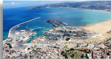
Tangier Med Port