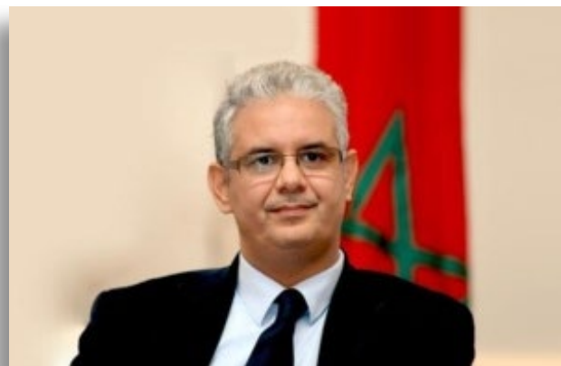
H.E. Nizar Baraka, President of Morocco’s Economic, Social, and Environmental Council and Chair of the Economic Working Group of the U.S. - Morocco Strategic Dialogue.