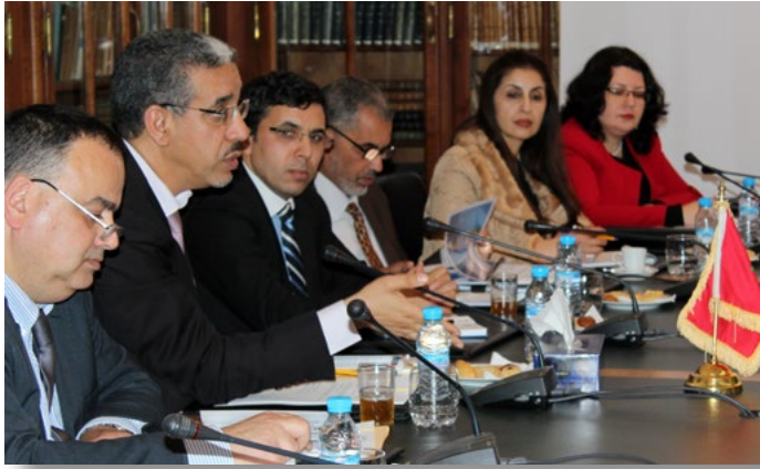
Minister Aziz Rabbah (second from left) and his team meet with the NUSACC delegates.

Development Conference in Rabat in conjunction with the National U.S. - Arab Chamber of Commerce, which provided a great opportunity to engage with key government officials and private sector leaders in Morocco's automotive sector."