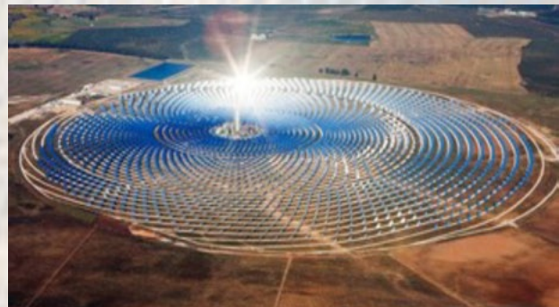
The Noor 1 solar power station, located in Ouarzazate, will soon be the world’s largest concentrated solar power plant.

As part of its commitment to tap into renewable energy sources, Morocco has undertaken a vast wind energy program. The Moroccan Integrated Wind Energy Project, spanning a decade with a total investment of about $3.8 billion, will enable the country to bring the installed capacity from wind energy alone from 280 MW in 2010 to 2,000 MW by 2020.